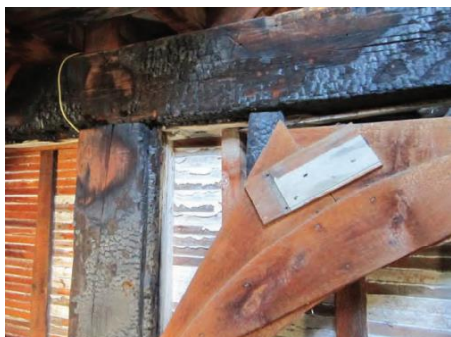
Fire damage in 1834, in an area under the clock tower.

These reports are available to you on the Mont Vernon Town website, on the left side of the Heritage Commission page. Take a look! https://www.montvernonnh.us/heritage-commission